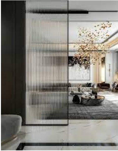
Patterned Glass Partition