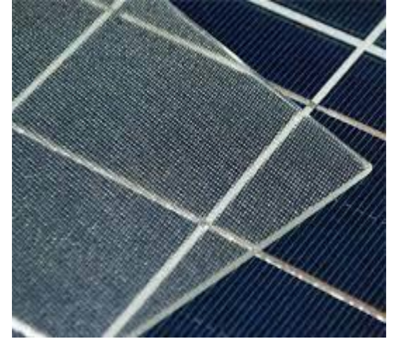
Solar Patterned Glass