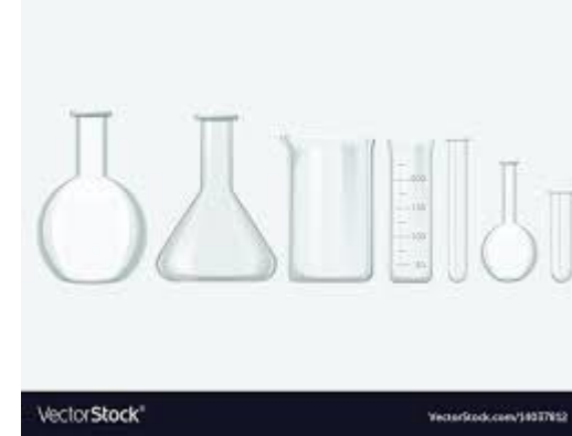
Borosil and Schot Glass